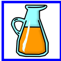
Oil (baby or cooking)